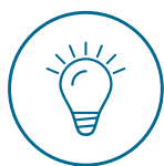
Lean Thinking Courses

Our experienced professionals have successfully trained thousands and completed consulting assignments and research studies in these fields for most of the major organizations in the region, covering the following different areas: