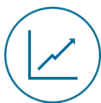
Accounting & Finance Courses